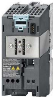
Drive, power module