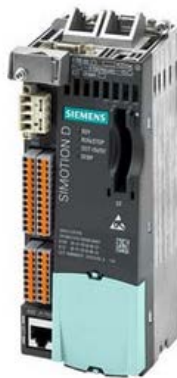
CPU for servo press control